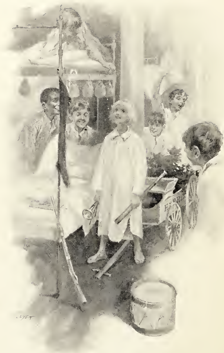
"THE KID WAS STANDING BAREFOOTED IN THE PASSAGEWAY."